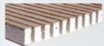
Delivered in flat pack.