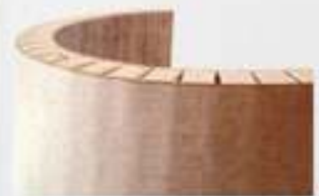
Formed to virtually any curve.