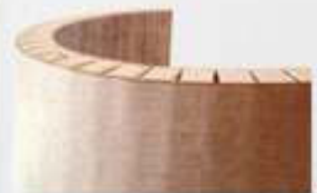
Formed to virtually any curve.